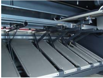
(Option- pic from SB machine)