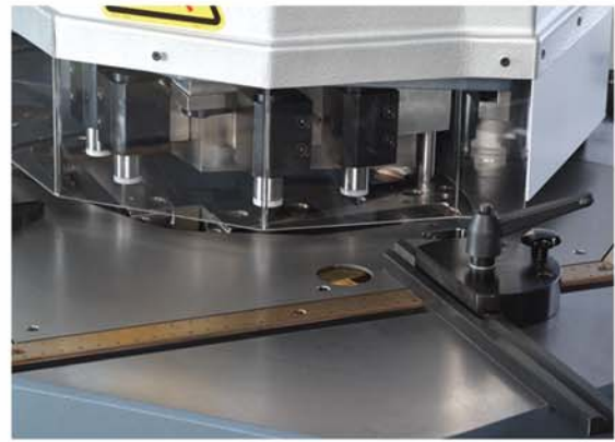
T-Slotted Table with Disappearing Stops Material Hold Downs